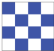
N – Abandonment