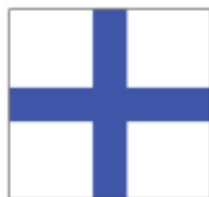
X – Individual Recall