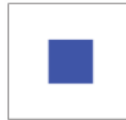
S – Shortened Course