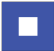
P - Preparatory Signal