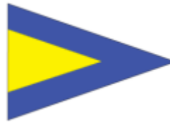
First Substitute – General Recall